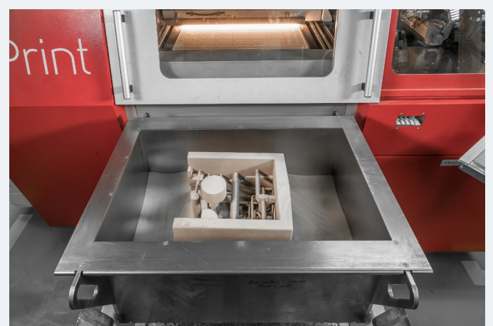
Build envelope with 3D-printed sand core and surplus sand

The adapted channel guidance also leads to flow optimization and increased energy efficiency. It comes to reduced pressure losses and noise reduction. Get the "last bit" out of your manifold!